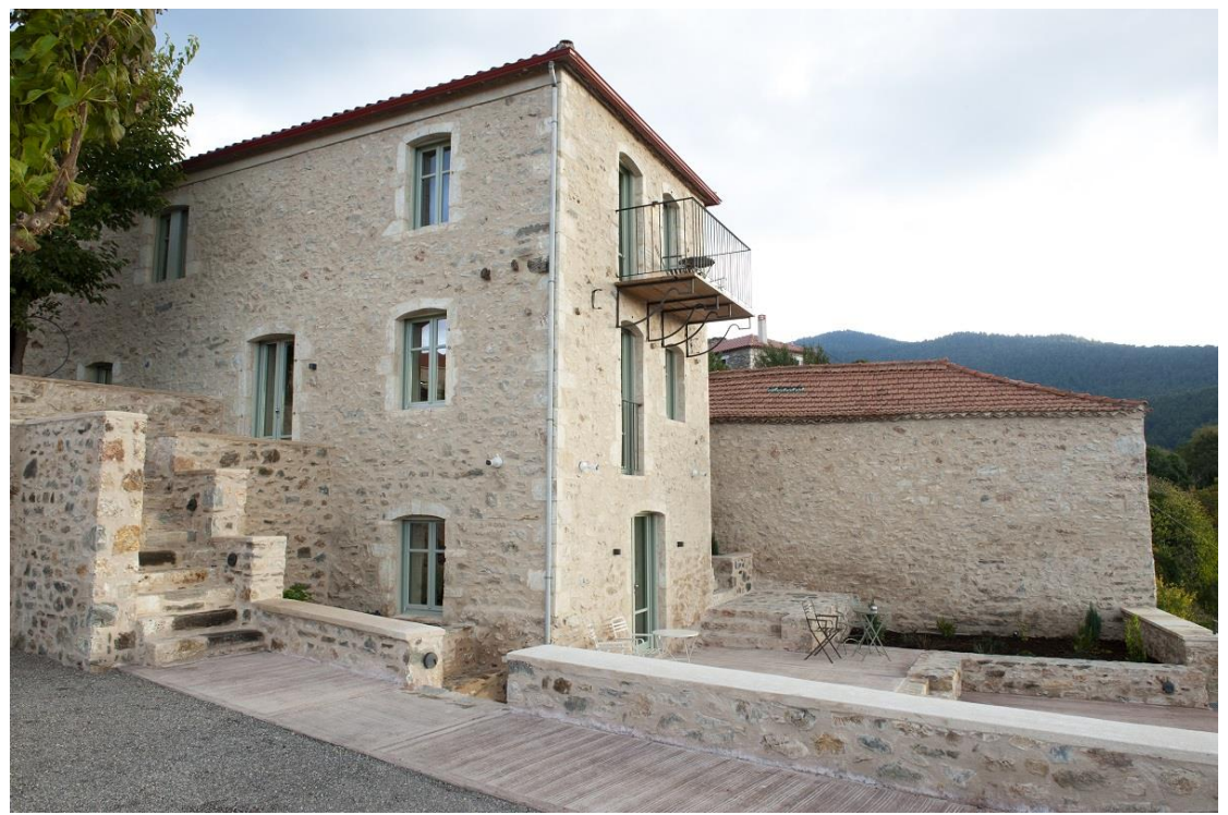
Guesthouse "Rouga of Vamvakou".