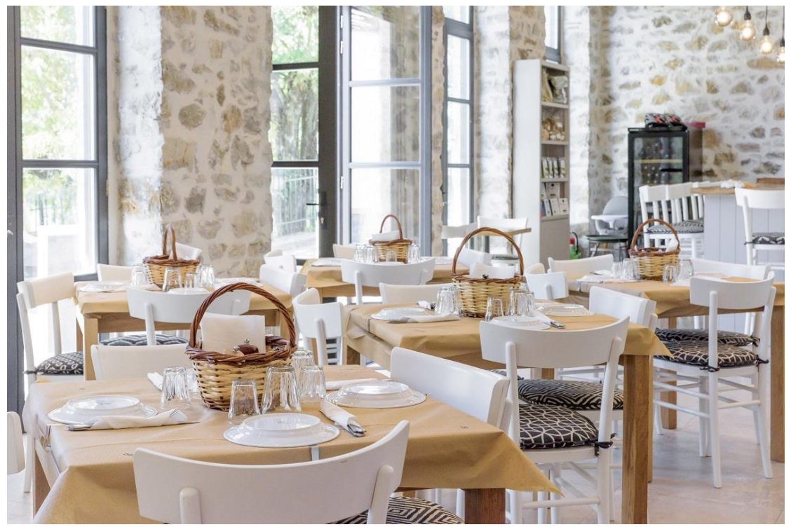
Restaurant – Café "Voureiko". ©ETSI Architects / Ioannis Promponas