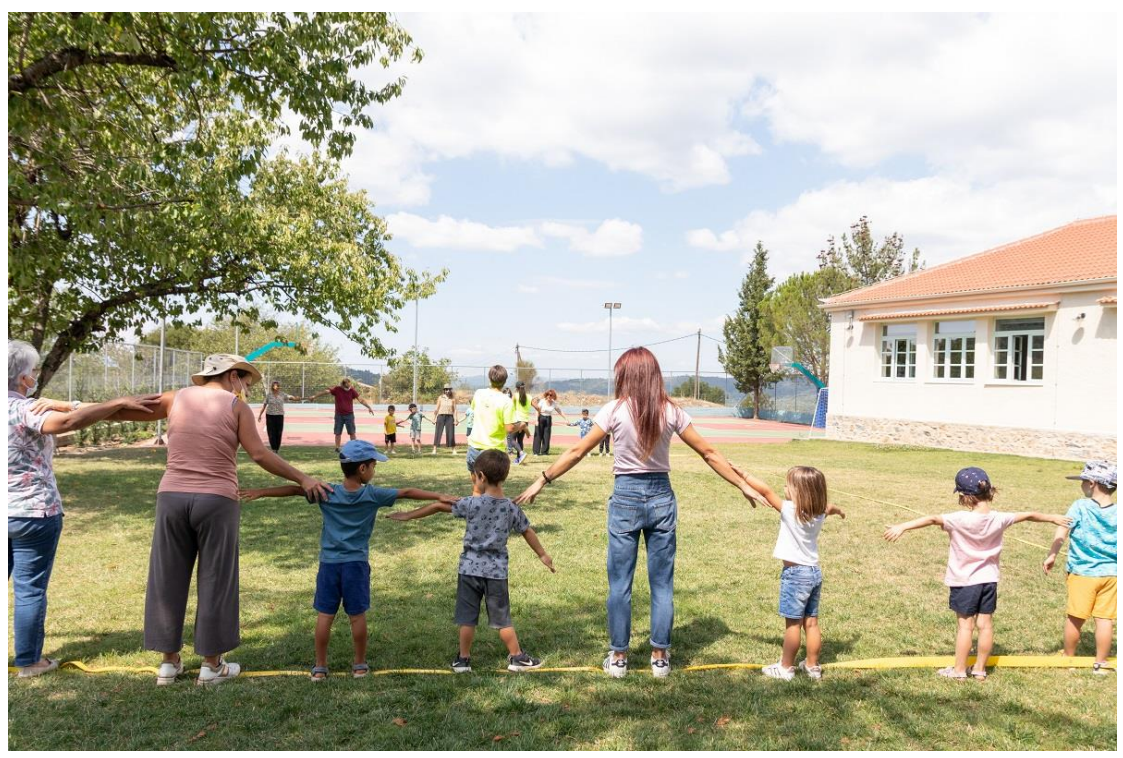
Family Activities.