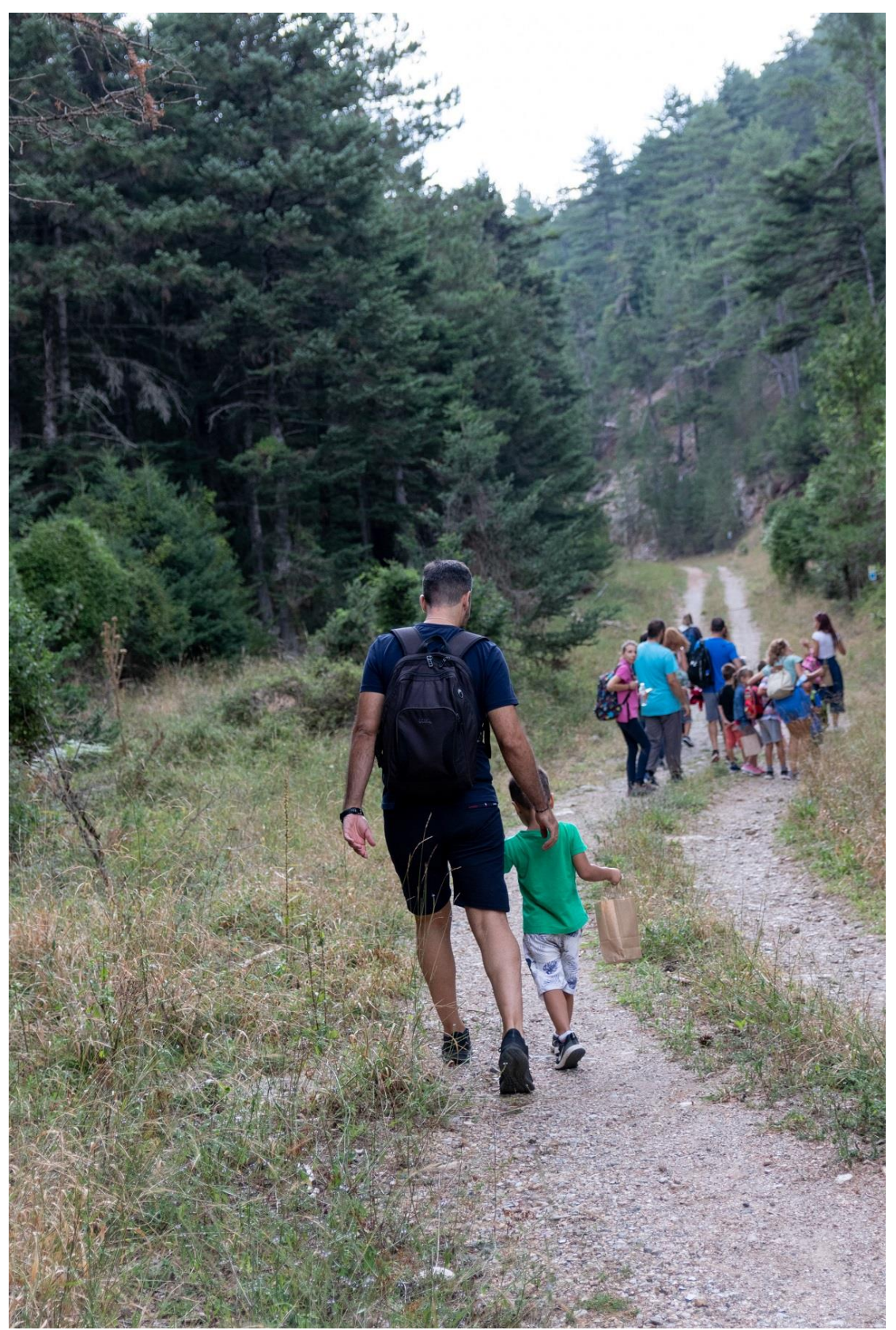
Hiking.