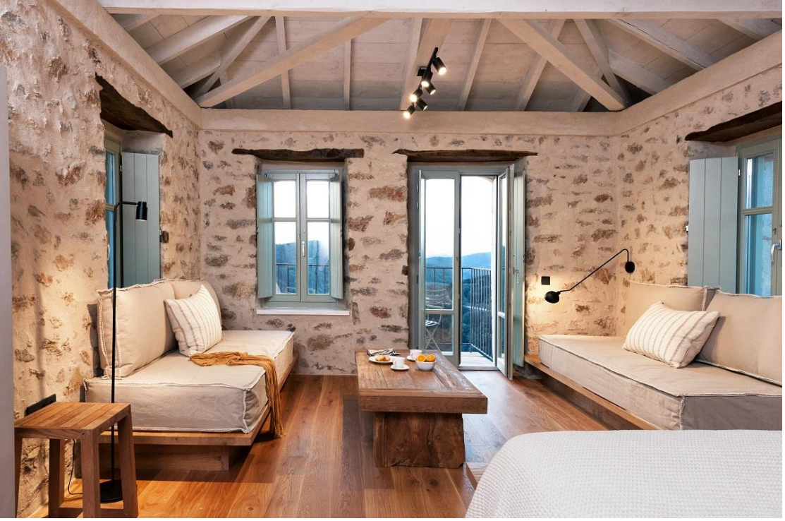
Suite at "Rouga".